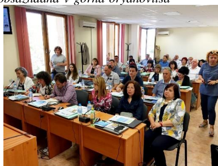
Stakeholders from Yantra River Basin