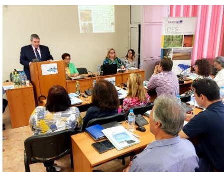
Welcome on behalf of the Gorna Oryahovitsa Municipality – mayor Dobromir Dobrev